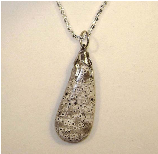
Oolitic chert pendant necklace.

exhibited along with finished gemstones. A brief Powerpoint presentation summarizing lapidary will open the meeting. This will be followed by a live demonstration that will include operating a tumbler and polishing a gemstone on a lapidary grinding wheel. The tumbler that will be used is a Lortone model which has an opening in the top of the drum that allows one to see into the tumbler while grinding is taking place. This will be an opportunity for members to become familiar with lapidary equipment and learn how it works along with some of the techniques of the hobby/trade. Both Juniors and regular members are welcome, along with questions and comments. We hope that you can make it.