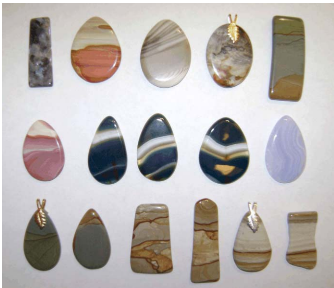
Gemstone pendants made using the equipment that will be demonstrated.

A polished serpentine gemstone will be given to each junior rockhound attending the March meeting.