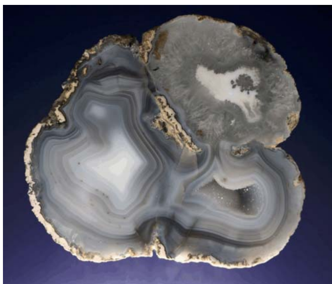
An unusual geode with both solid and hollow sections.