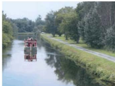
Along the Erie Canal

We're proud to be the host club in 2011!