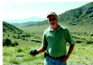
In the field, Montana, August 2009