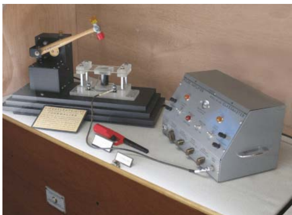
Automated display of piezoelectricity in a tourmaline crystal, now at Sterling Hill Mining Museum.