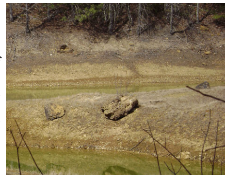
“Lump ore” occurs beneath the wash ore, with lumps ranging from 10 cm to 1 m and more, as shown in the photo above. Lumps at Scotia commonly show breccia textures made up of broken fragments of chert, sandstone, or clay in a matrix of limonite and goethite (photos, below left). According to Dr. Arthur Rose, an economic geologist at Penn State, lump ore near the base of the weathered zone ( i.e. , wash ore zone) was a target of mining in Centre County, undoubtedly because of the high concentrations of iron.

Three major types of ore have been described from Scotia and other iron ore deposits in Centre County: wash ore, lump ore, and pipe ore. “Wash ore” is composed of ore clasts (rock fragments) ranging from 1 to 10 cm in diameter mixed with a large amount of unconsolidated clay and sand. It forms the surface shown in the scenes at left and right. It gets its name from the considerable amount of washing needed to separate it from the non-iron-bearing material.