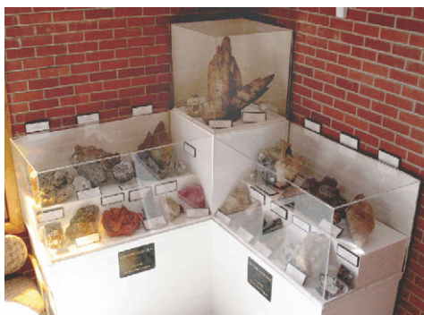
A mineral display at the museum.