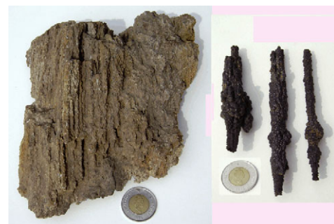
Pipe ore (left) from the Pennington iron ore bank located west of Pennsylvania Furnace, PA, and (right) iron ore speleothem from Connecticut (see text). Coins are 1.1 inch across.