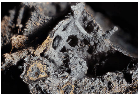
Goethite (based on color and brown streak) rod forms in a vug in freshly broken lump ore from the Scotia pit. Minor tan minerals appear to be alteration products. Field of view approx. 1 inch across.

a brown streak (powdered sample). Limonite is yellow-brown to brown and has a yellowish streak, and the hematite is red and exhibits a reddish-brown streak. Approximately 1.7 million tons of iron ore are reported to have been extracted from Scotia (Rose, 1995 after Butts and Moore, 1936).