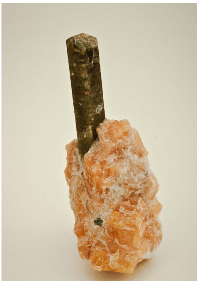
Fluorapatite crystal from the Yates Mine, Otter Lake, Quebec, Canada. J. Passaneau specimen and photo.