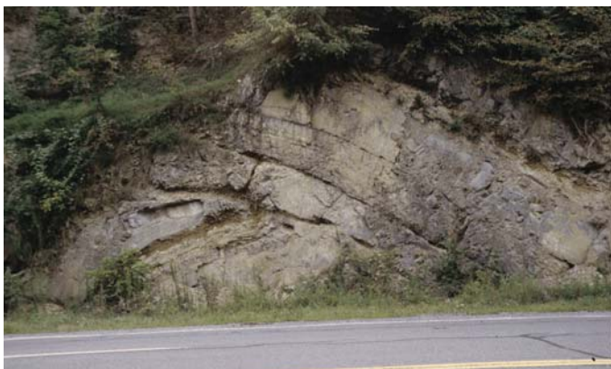
Thrust faulted anticline; Charlie Hill road-cut; Rt. 22; ~ 8 mi. north of Huntingdon; between Huntingdon and Water Street, PA; 2-1999. (1985, Central Pennsylvania Geology Revisited, Guidebook for 50 th Annual Field Conference of Pennsylvania Geologists, pp. 192-203)

In 1972 Mountain Press Publishing Company began the popular Roadside Geology book series. Professional geologists write and edit the books for people who are not geologists but who would like to learn something more about roadcuts, vistas, and exposures along roads. This talk is an extension of that theme and begins locally and expands outward from State College. Each locality is discussed briefly without technical jargon so as to keep with the theme of providing information for non-geologists. Seeing these localities through the eyes of a geologist will be informative and, hopefully, interesting.