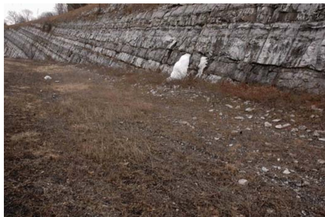
Route 322 at the intersection with Route 26 (State College, PA), exposing repetitious strata of limestones and dolomites; 2010.

Beyond State College, our traverse in Pennsylvania expands to Altoona, Hollidaysburg, Bellwood, Water Street, Spring Mills, Castanea, Williamsport, Renovo, Lewistown, Towanda, Swatara Gap, Chambersburg, Carlisle, Gettysburg, and Pittsburgh. Localities beyond Pennsylvania will be covered in future talks.