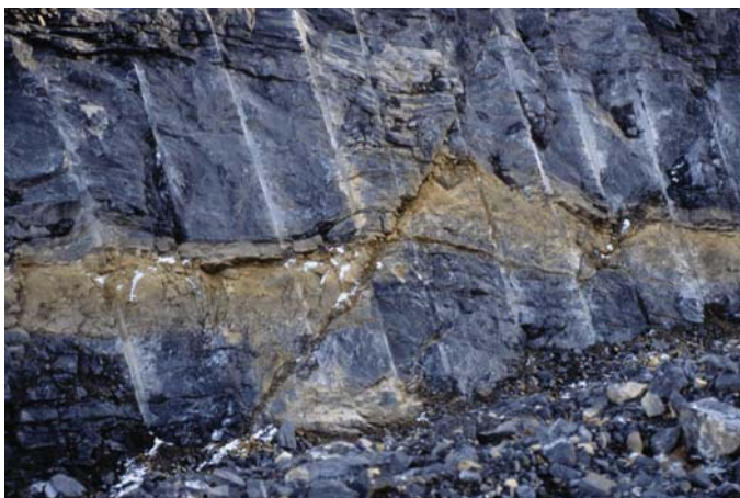
Normal fault in the Gatesburg Formation, exposed during construction of the I-99 Scotia interchange; 12-22-2001.