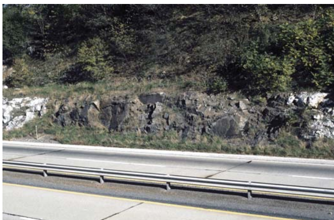
Diabase dike (dark) intruding Cambro-Ordovician limestone (light colored, at left and right sides); (Old) Exit 16 of PA Turnpike (I-76); Carlisle, PA; 1974. During late Triassic and, mostly, Jurassic time, diabase followed deep-seated fractures associated with the rifting of Pangaea.