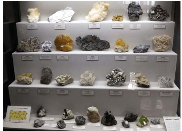
Mineral specimens from across Pennsylvania are shown in one of the new displays at the Masters Mineral Gallery.