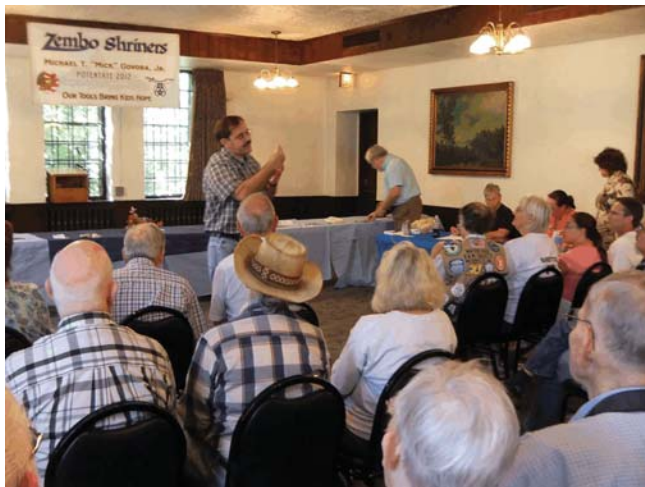
A silent auction raised funds to benefit EFMLS.