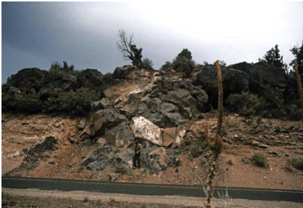
Feeder dike and basalt flows; Dixie National Forest near Veyo, UT; 5-27-75. Series 3791-3793.