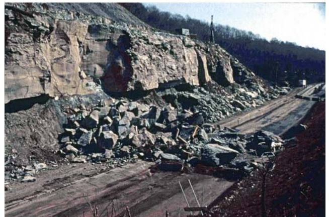
Rockfall/rock slide; Saw Mill Road; Pittsburgh, PA; 2-16-83. This slide occurred just 10 minutes after workers set off 17 small explosive charges to clear rocks off slopes. Two people were killed and one injured. Did blasting loosen mud behind the large boulder just enough to cause it to topple to the roadway about 60 feet below?