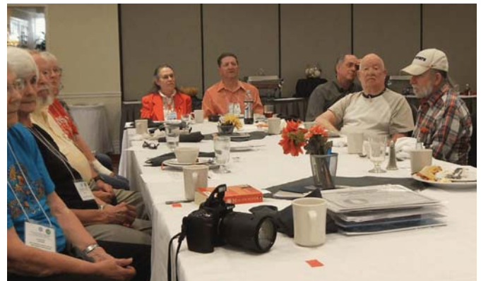
Discussions and bulletin award presentations took place Sunday morning at the Editors' Breakfast.