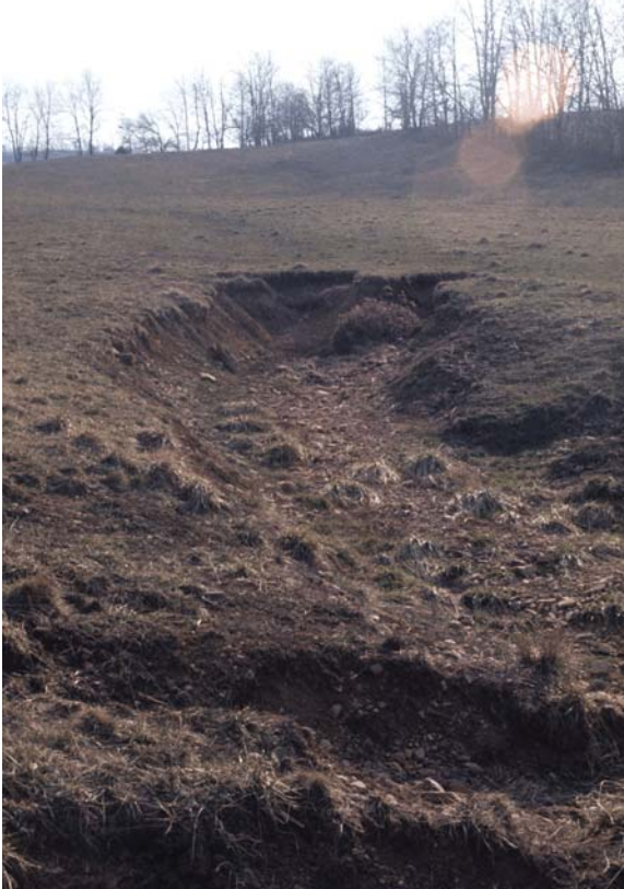
Headward erosion off I-81 at Shippensburg, PA; 1971. This type of erosion always progresses in a direction opposite flowing water. If this headward erosion continues long enough, it will cross the drainage divide at the top of the hill.