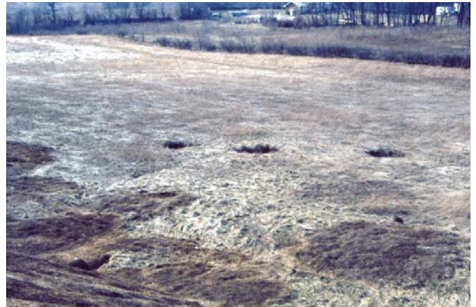
Rectilinear alignment of three sinkholes suggesting development on a fracture trace. Adjacent to I-81 at Carlisle, PA. Also note the sinkhole in the lower left. 1970.