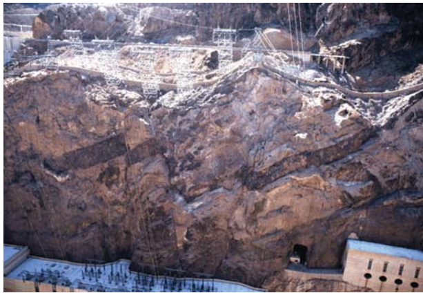
En echelon normal faults offsetting a latite sill in the wall of Black Canyon at Hoover Dam on the Colorado River; Boulder City,