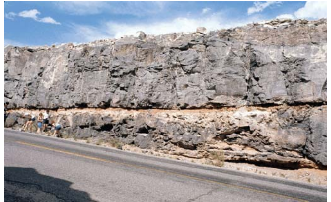
Basalt flows between which a paleosol (lighter color; paleosol) developed; 5 mi. south of CO/NM border; US 285, Three Rocks, NM; 6-3-75. Paleosols provide information on past climates, vegetation, and weathering.