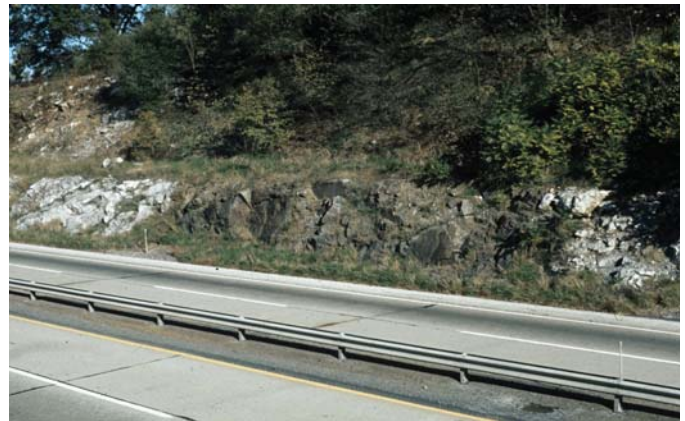
Triassic diabase dike (dark) intruding Cambro-Ordovician limestone (light color); Exit 16 (New Exit 226) of PA Turnpike (I-76); Carlisle, PA; 1974. During late Triassic and, mostly, Jurassic time, diabase followed deep-seated fractures associated with rifting of Pangaea. Dike temperature was approximately 1100° C (2012° F) causing contact or thermal metamorphism.