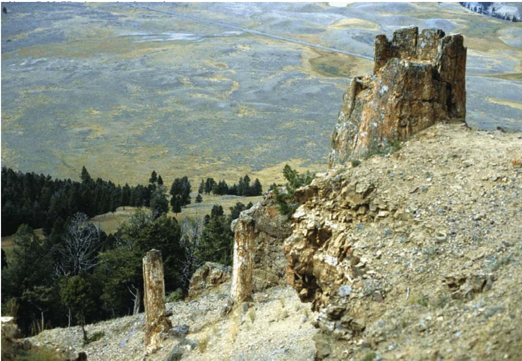
Petrified giant sequoia stump (right) and two other petrified trees (lower center); Specimen Ridge; Yellowstone National Park, WY-MT. The petrified forests of Yellowstone are the most extensive of their kind in the world and contain information about the climate and geologic history of the Rocky Mountain region some 55 million years ago. They are unique in that many of the trees are in original growth position; and that, at Specimen Ridge, the process of burial and petrification took place not once but 27 times.

Our western-states roadside geology includes Douglas Pass, Colorado - notorious for landslides; slumping and earthflows; I-40 at Rockwood, Tennessee that, prior to Skytop, was the most expensive stretch of U.S. highway; a paleosol (paleosol); an obsidian flow; en echelon faults at Hoover Dam; the world's largest petrified forest at Yellowstone National Park; radial dikes; a feeder dike and lava flow; a volcanic neck; fault scarps; and more. Douglas Pass has the distinction of being significant to geologists for two reasons: it is one of the best Eocene