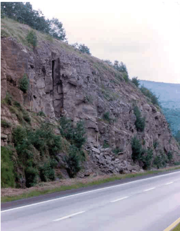
Rockfall and incipient rockfall; I-81N. near Hazelton, PA; 7-73. Note the rock separation toward the top of the road cut.