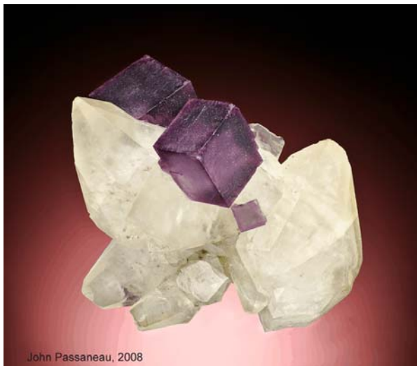
Cubic crystals of purple fluorite, Cave-in-Rock, Illinois.

This talk focuses on fluorite, using it as an example to introduce the beginning collector to some of the basic principles of mineralogy. ❄