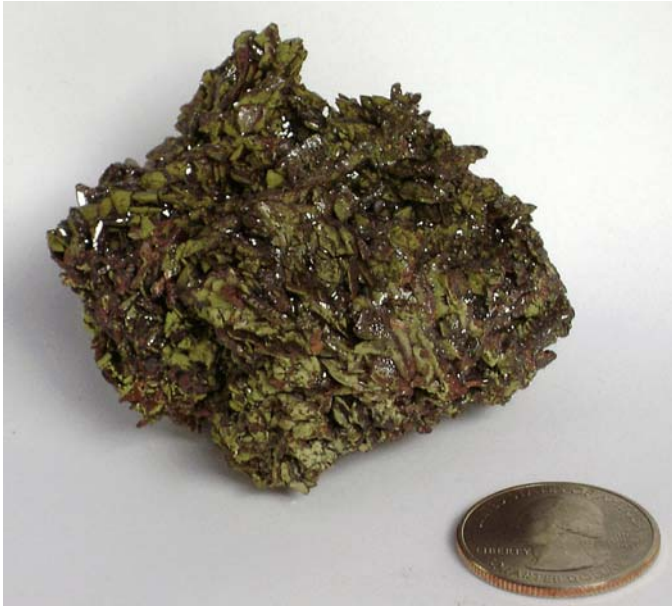
This descloizite specimen was once in the collection of our late member John Passaneau. A lead-zinc vanadate hydrate, PbZn(VO_4)(OH) , it is from Tsumeb, Namibia.

Shown below are two door prizes which we plan to offer at the September 21 st meeting.