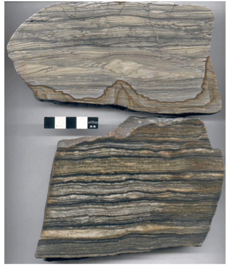
Figure 2: Polished tidal rhythmites from central Utah.