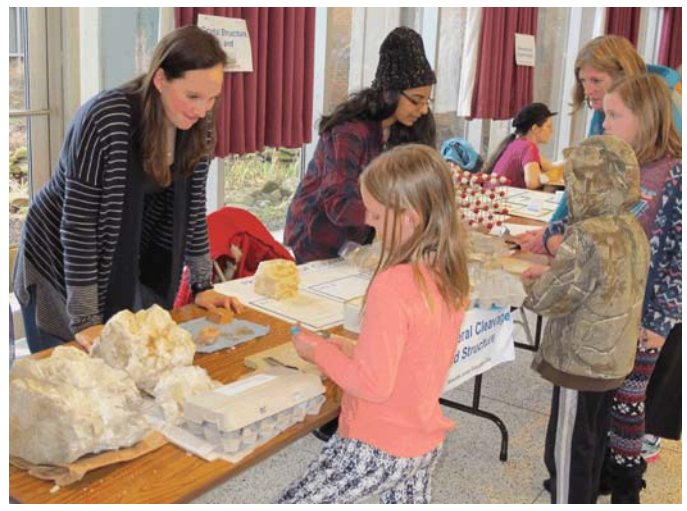
Two stations covered a range of mineral properties related to their ordered atomic arrangement: crystal formation and structure, mineral cleavage, and constancy of crystal angles.

constancy of crystal angles. At each station they received a labeled specimen or other item to remind them of the topic and what they learned.