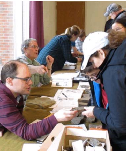
Students at the invertebrate fossil station recovered fossils from weathered rock, and also received two fossils from other locations.

We also had a sales table as a source of a variety of additional mineral, fossils and polished stones, at childfriendly prices. The $5 admission charge does not usually cover all of the costs of the event, so income from the sales table is greatly appreciated. Most of the material at both the sales table and the stations was donated, and Nittany Mineralogical Society is very grateful to those who have donated, both this time and through past years.