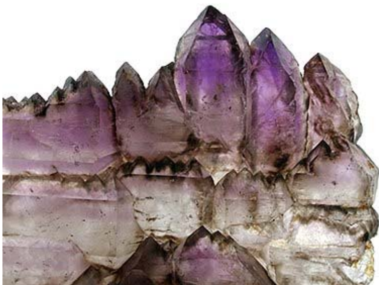
Quartz, variety amethyst and smoky quartz. Locality: Shaw and Esrey's Quarry, Chester Township, Delaware Cty, Pennsylvania. Size: small cabinet, 9.2 x 6.8 x 2.0 cm