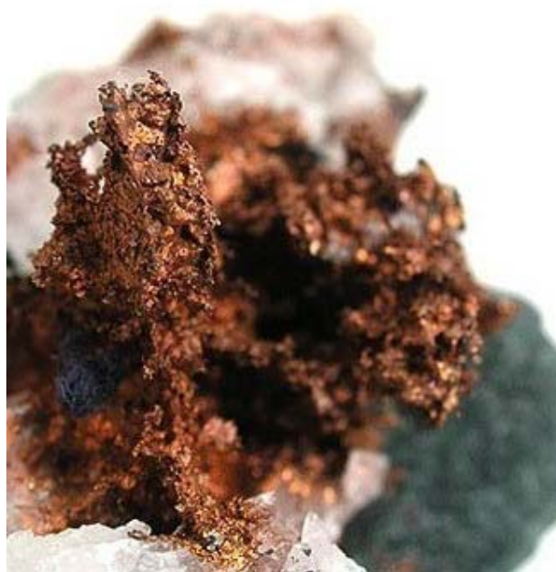
Copper. Locality: Greenstone Quarry, GAF Ruberoid Mill, Blue Ridge Summit, Adams County, Pennsylvania, USA (Locality at mindat.org). Size: small cabinet, 8.3 x 5.9 x 2.8 cm