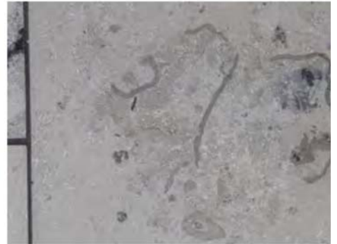
The above three photos—burrows? worms? crawling critters?