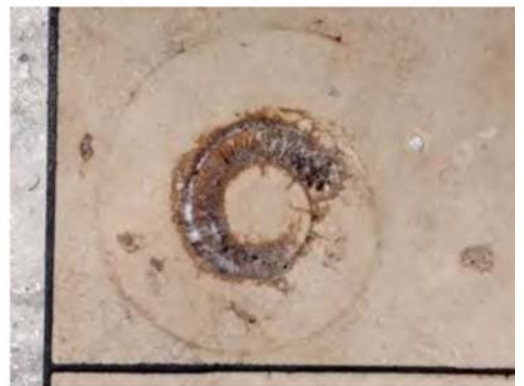
The above three fossils are ammonoid cephalopods perhaps of the genus Progeronia . Note penny on the left photo.