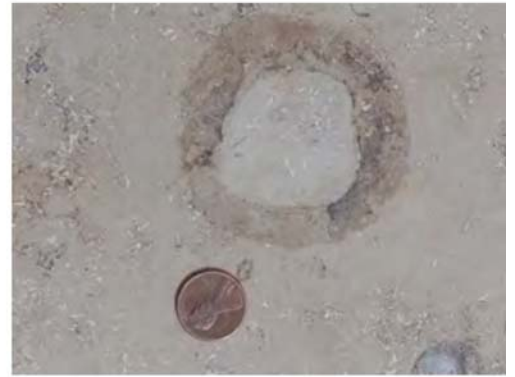
These three specimens may be sponges. I am fairly certain the photo on the right is a sponge of some sort. Note penny for scale.