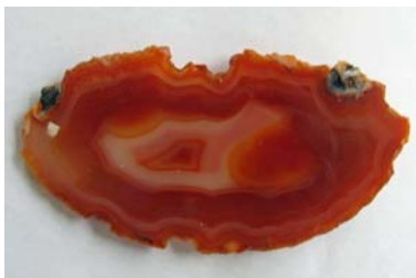
"Rattle agate" slab (handle with care!), 5"