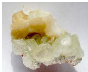
Stilbite on apophyllite, Nasik, India, 2.5".