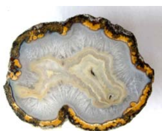
Agate nodule, polished, 5"