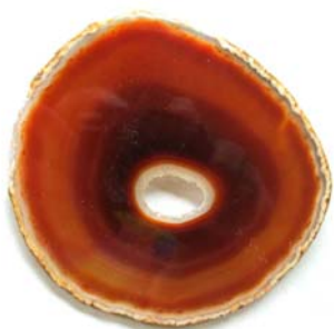
Agate slab, polished, 4"

NMS will be selling some items from our stock to raise funds. A few are pictured here.