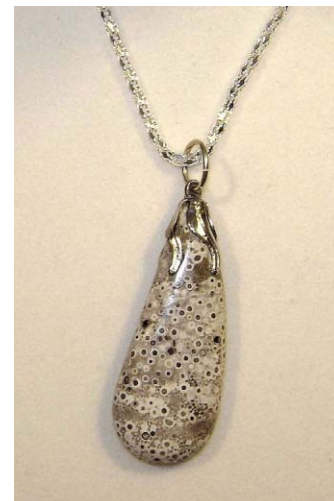
H Oolitic Chert pendant necklace made by the author, from chert collected near State College.

Conservancy can be found at http://www.clearwaterconservancy.org/events.htm . There is no admission fee to attend the Festival. Events will include: live music; talks; educational and fun activities including demonstrations and board walk tours of the nature area; gift baskets raffle; exhibits; and food. If you attend – please stop by the NMS table to say hi and see our presentation.