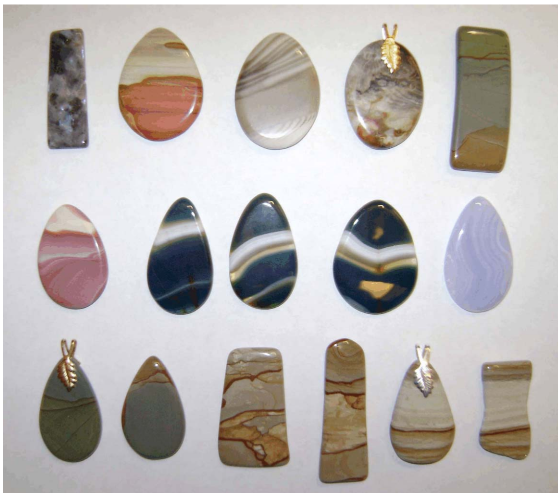
Gemstone pendants made by the author using the equipment that will be demonstrated during the Spring Creek Family Day Festival.