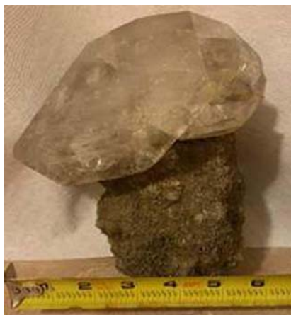
6-inch Herkimer "diamond" from Mohawk (EFMLS News, May 2023)

The big EFMLS news is the Convention coming up in Syracuse, New York, on July 7-9, and its associated field trips, which are described in the newsletter.