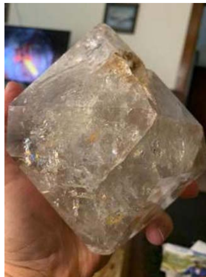
Another huge Herkimer "diamond" from Mohawk Valley Mineral Mining.